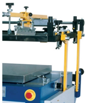
Screen printing frame allways in horizontal position