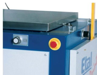
Micrometric registers on the printing plate